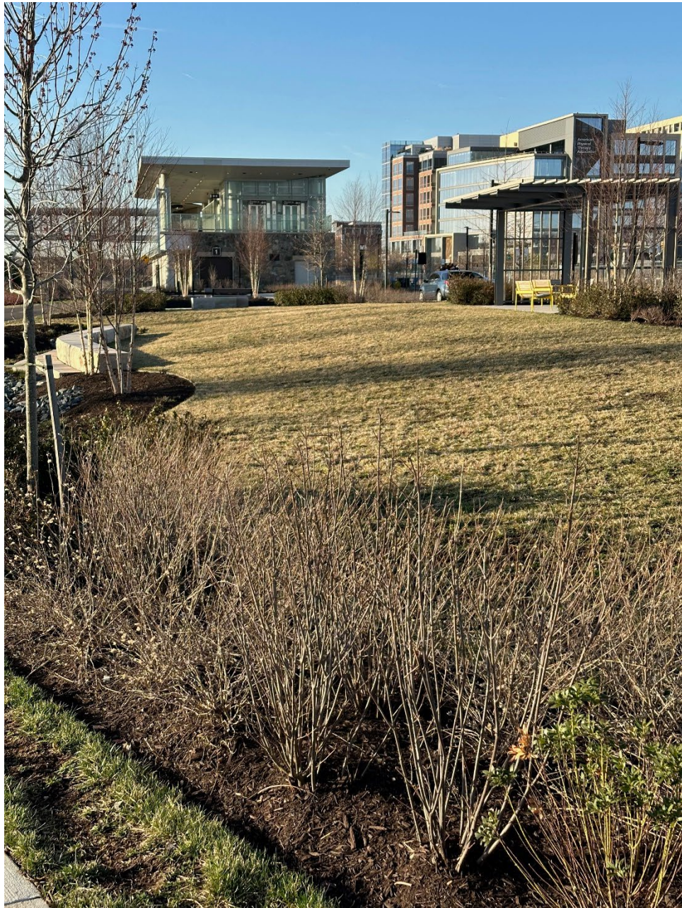
View from the south end of the park to the Potomac Yard Metro's North Pavilion.