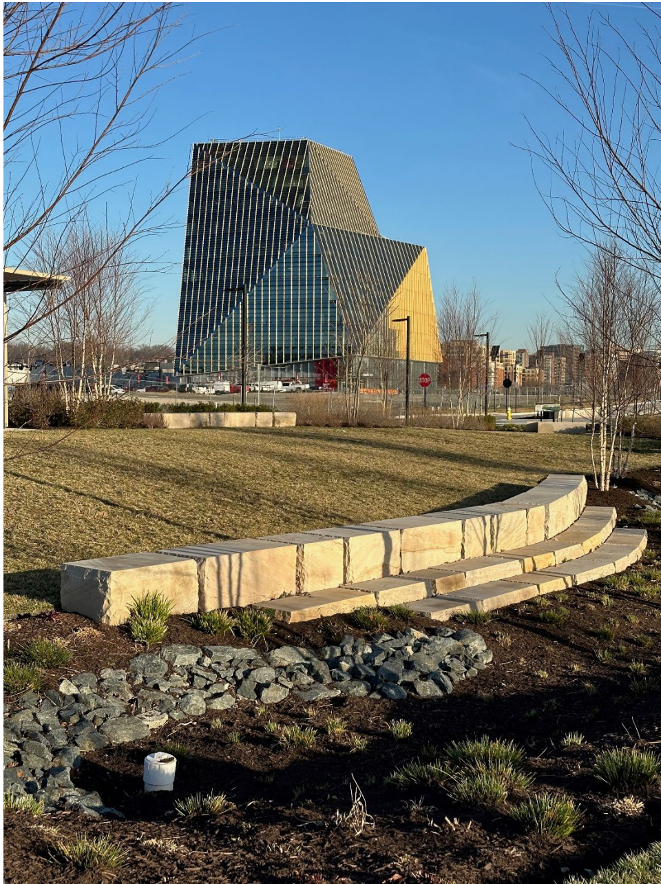
View from the park to a new academic building on Virginia Tech's Innovation Campus.