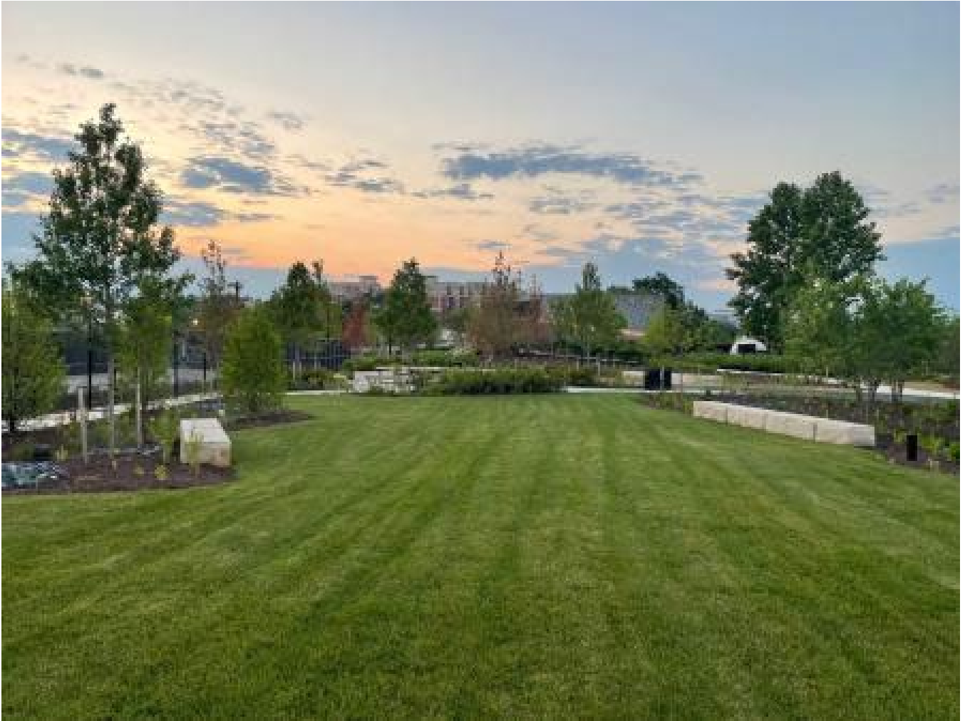
View to the north from the park's north lawn