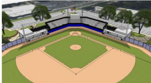
Site Improvements (View South-West)