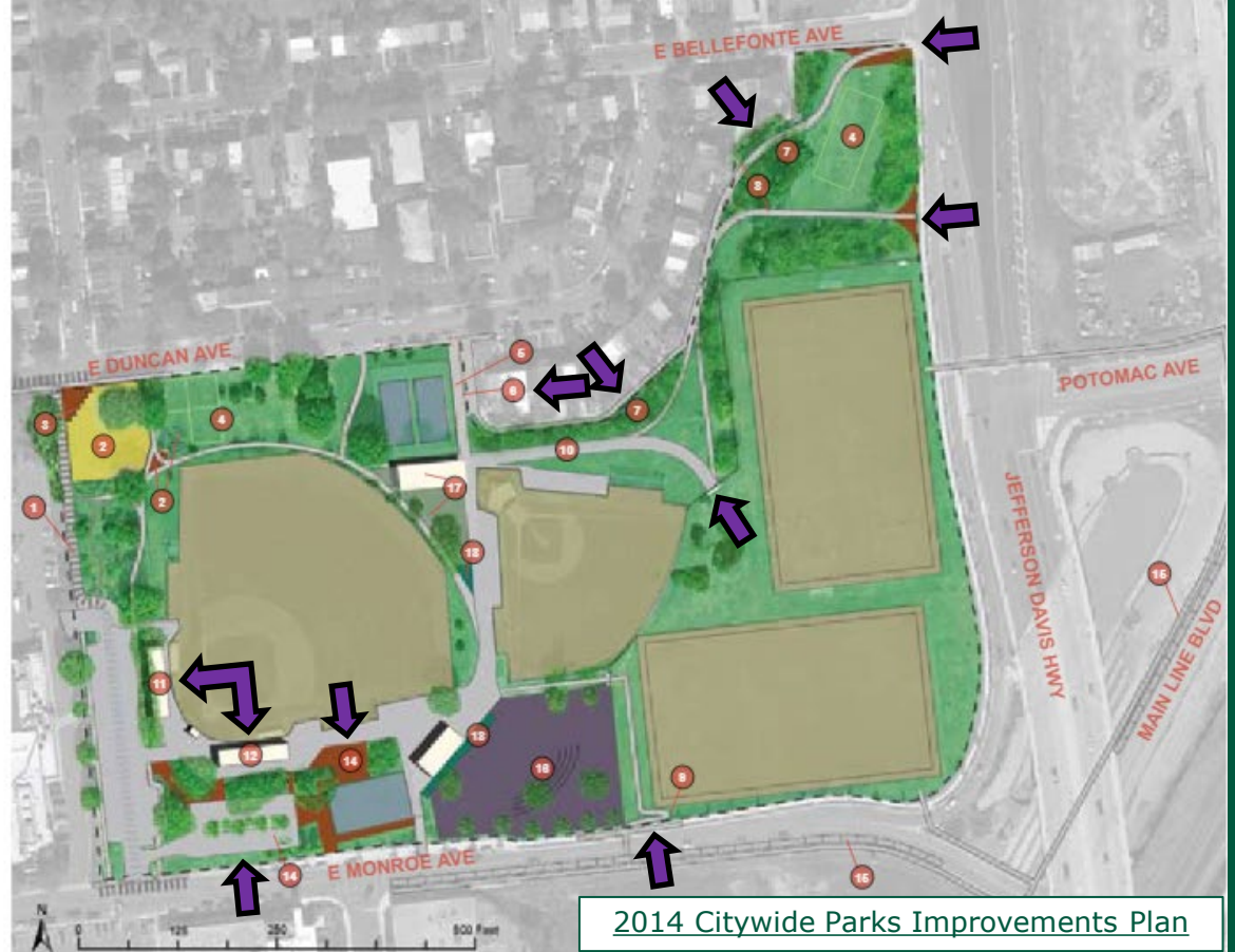
2014 Citywide Parks Improvements Plan