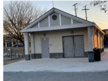
A1 CONTEXT IMAGE A-2019 12" = 1'-0"