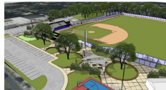
Site Improvements (View North-West)