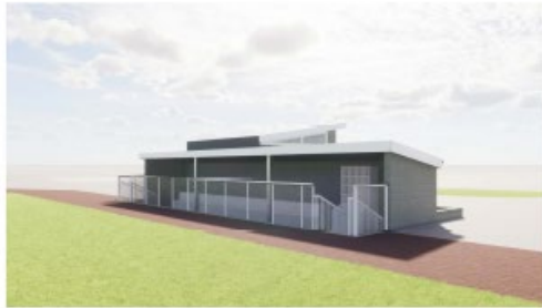
B4 DUGOUT VISUALIZATION A-2019 12" = 1'-0"