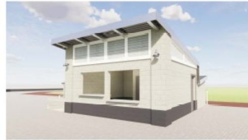
B1 CONCESSIONS VISUALIZATION A-2019 12" = 1'-0"