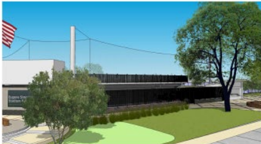
Rear Bleacher Screening