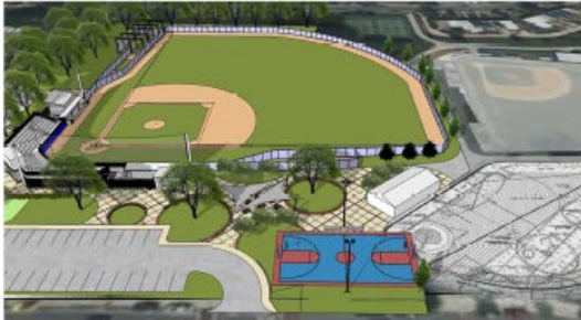
Site Improvements (View North)