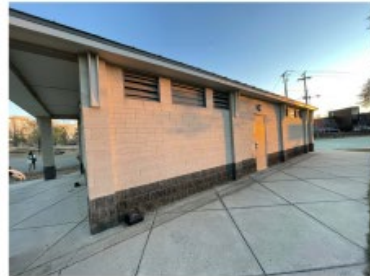
A4 CONTEXT IMAGE A-2019 12" = 1'-0"