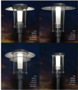
Pathway/ Plaza Lights