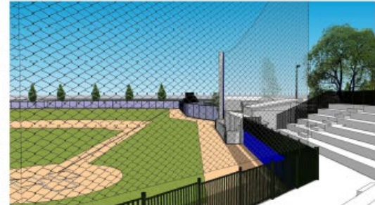
Big Simpson Bleacher