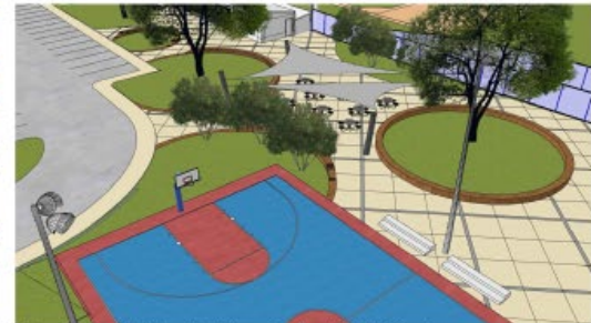
Basketball Court / Pedestrian Plaza / Seating / Shade Structure