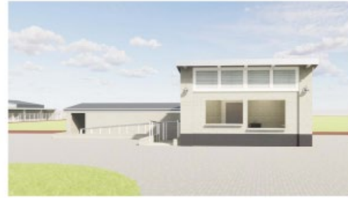
C1 CONCESSIONS VISUALIZATION A-2019 12" = 1'-0"