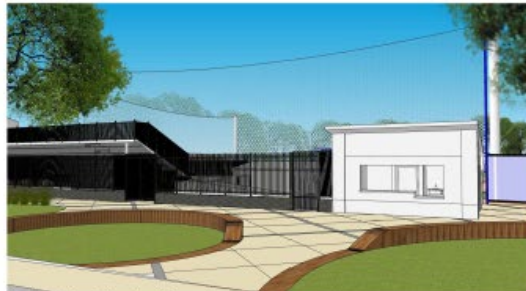
Seating / Rear Bleacher Screening