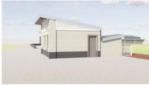
C4 CONCESSIONS VISUALIZATION A-2019 12" = 1'-0"