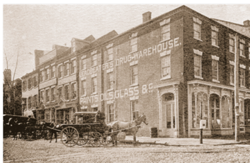
Stabler-Leadbeater Apothecary Museum