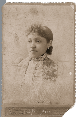
Alexandria Black History Museum