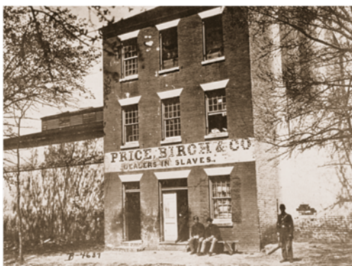
When Union troops occupied Alexandria during the Civil War, they took control of the slave pen then operated by Price, Birch & Co.

“We were first taken out into a paved yard 40 or 50 feet square, with a very high brick wall and about half of it covered with a roof. . . He (Armfield) ordered the men to be called out from the cellar where they sleep. . . they soon came up. . . 50 or 60. While they were standing, he ordered the girls to be called out. . . About 50 women and small children came in. . . and I thought I saw in the faces of these mothers some indication of irrepressible feeling. It seemed to me that they hugged their little ones more closely, and that a cold perspiration stood on their foreheads. . .”