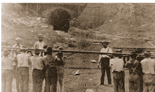
Richard Dodson Collection

development. Quakers supported the growth of Hayti by renting and selling property to free black families. Today, several wood and brick townhouses still survive on the 400 block of South Royal and the 300 block of South Fairfax streets. The Wilkes Street Tunnel, built for the Orange and Alexandria Railroad in 1856, is a Hayti landmark.