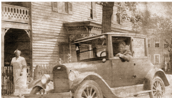
Home in Uptown Neighborhood, circa 1926

The Uptown neighborhood developed before the Civil War. By 1870, with many African Americans migrating to Alexandria during and after the War, Uptown grew into a large neighborhood. Many black churches developed here. The Parker-Gray historic district protects the historic structures in Uptown . The total area of Uptown is about 24 blocks, making it the largest of the historic African American neighborhoods in Alexandria.