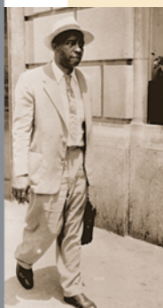
Alexandria Black History Museum